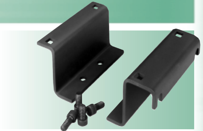
Special Hanger Bracket