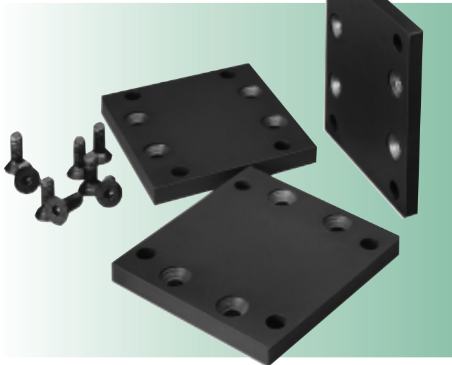
Base Modified to Customer Specifications

An assortment of special base and bracket mounts are offered in conjunction with the standard mounting accessories that are detailed in the Multimount and Integral sections of this catalog. All SE Encore base mounts, plates, and bracket mounts are covered with the WinGuard Epoxy Coating System. Please contact Winsmith for specific details of these special accessories.